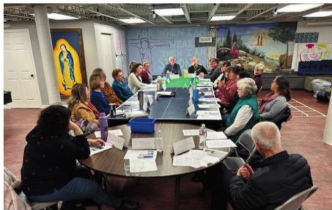
Mental Wellness Meeting