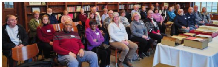
The St. Gregory the Great 60+ group toured the Atheneum on February 5 with stops at the Rare Book Viewing Room, and a guided tour of the Seminary, followed by lunch in the Refectory.